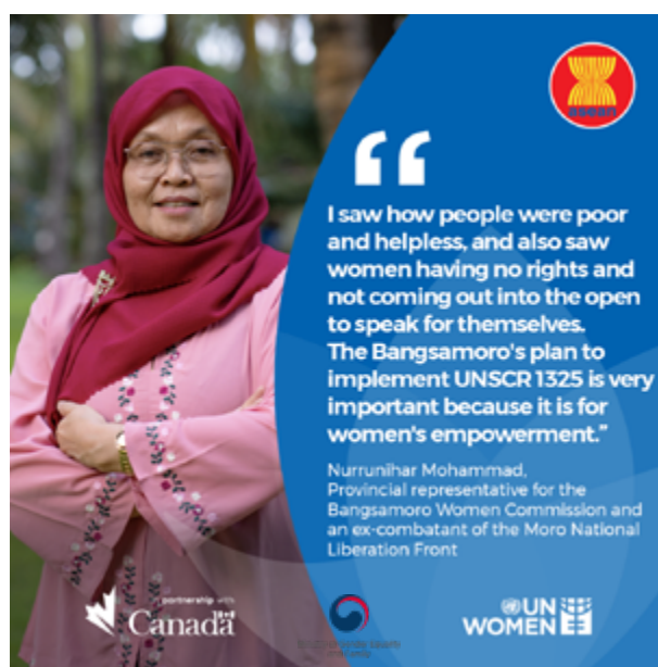
In the words of Nurruniyar Mohammad Read full story here